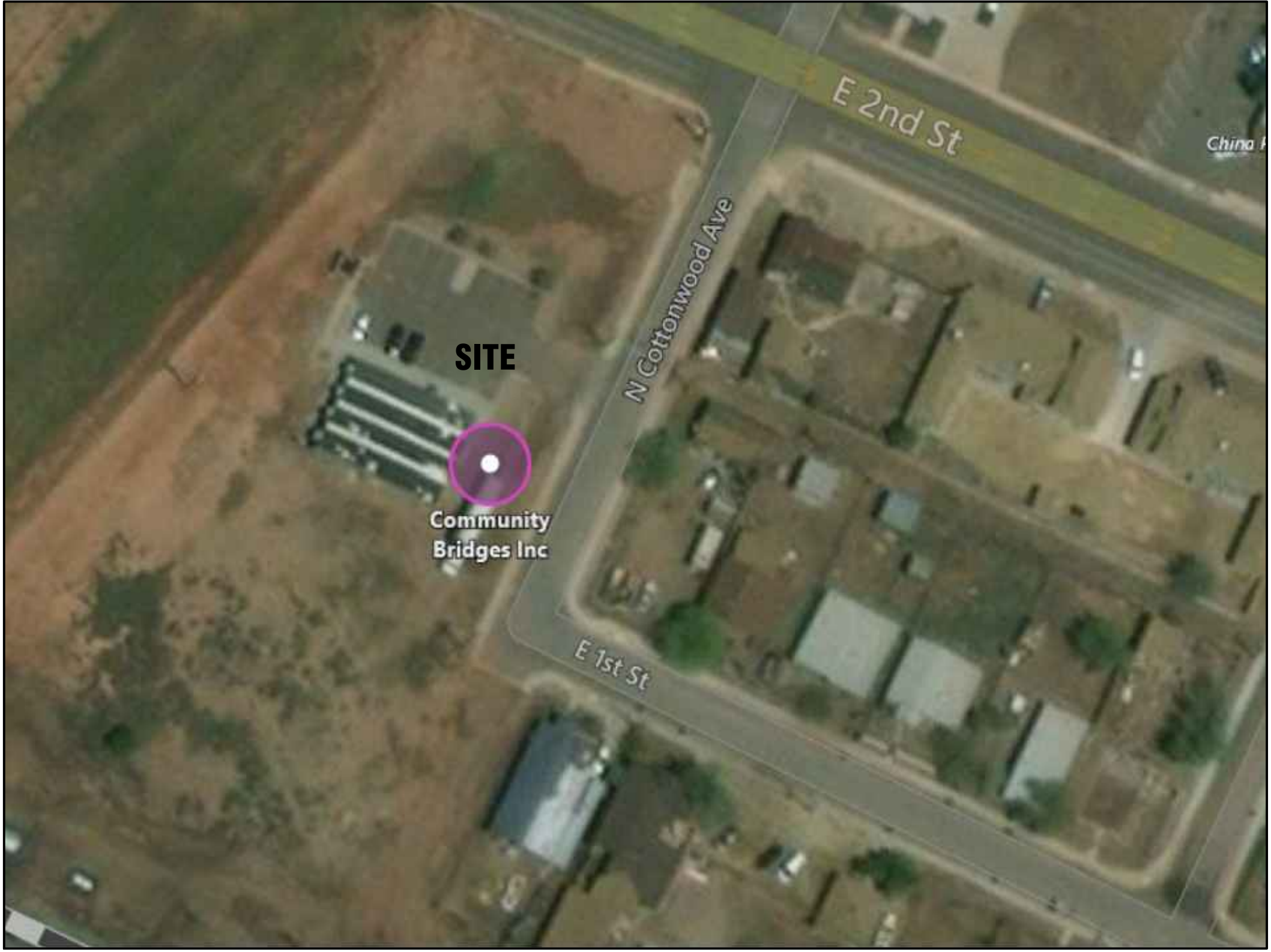
VICINITY MAP NTS